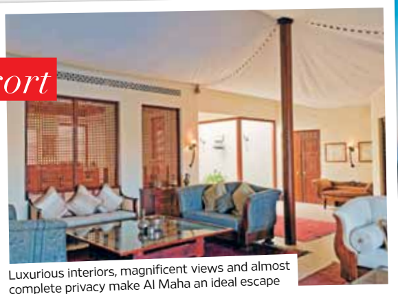
Luxurious interiors, magnificent views and almost complete privacy make Al Maha an ideal escape

Desert activities include guided nature walks, falconry and a gentle drive through the desert in a luxury 4x4. For maximum romance, take a