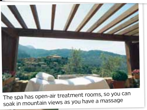
The spa has open-air treatment rooms, so you can soak in mountain views as you have a massage