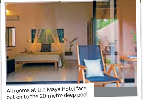
All rooms at the Maya Hotel face out on to the 20-metre deep pool

the local temples, or to watch the sun go down on its unspoilt sandy beaches. The Udu Walawe wild elephant park is a short drive from Maya and the hotel can organise a special picnic lunch to take with you.