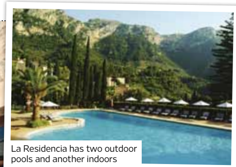
La Residencia has two outdoor pools and another indoors

There are several places to eat in the hotel and nearby, but for a special treat, dine on Mediterranean dishes by candlelight in the El Olivo restaurant, set