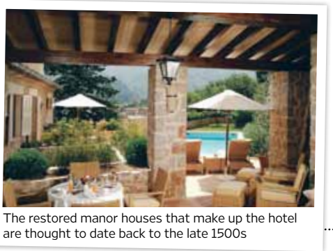
The restored manor houses that make up the hotel are thought to date back to the late 1500s

in a 16th-century olive press. The hotel ensures the romantic ambience is not broken by asking guests to surrender their mobiles to the hostess on arrival.