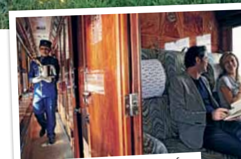
Journey back to a more elegant era of travel, complete with uniformed stewards

On the journey, enjoy afternoon teas and breakfasts served in the privacy of your own cabin.