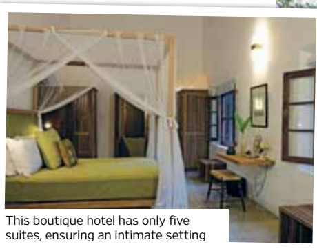
This boutique hotel has only five suites, ensuring an intimate setting

If you want to explore the local area, take a 15-minute drive to the seaside town of Tangalle to explore