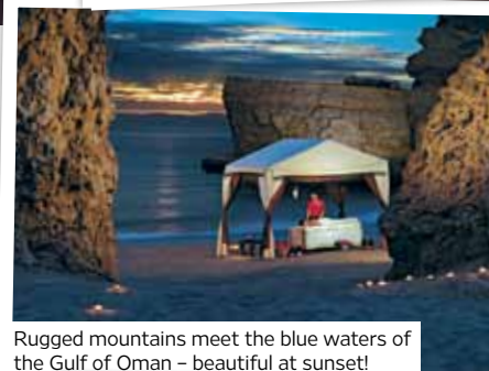
Rugged mountains meet the blue waters of the Gulf of Oman – beautiful at sunset!