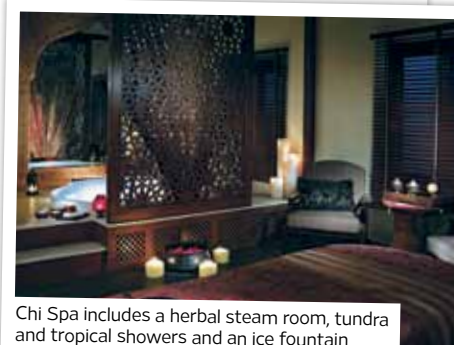
Chi Spa includes a herbal steam room, tundra and tropical showers and an ice fountain