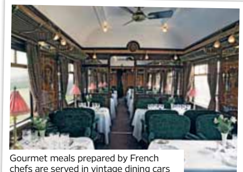
Gourmet meals prepared by French chefs are served in vintage dining cars

One of the highlights of this trip is the amazing wardrobe it requires – stepping back to an age where travel was gracious and elegant means you can dress up to the nines. The company's motto is that you can never be overdressed aboard the train.