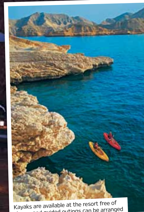
Kayaks are available at the resort free of charge and guided outings can be arranged

DETAILS Shangri-La's rooms start from Dh1,146 per night. The spa package includes a daily buffet breakfast, a hammam for both of you on the first day and an Aroma Vitality or Chi Balance treatment for both on the second day – this package costs from Dh1,950 per couple per night and is valid until May 31. Driving to Muscat takes four to six hours, or flydubai flies there for around Dh580 return. Visit www.shangri-la.com for bookings.