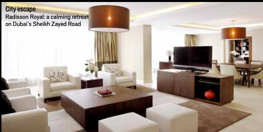
City escape Radisson Royal: a calming retreat on Dubai's Sheikh Zayed Road

This stylish boutique hotel comprises five suites in a restored Sri Lankan Manor House dating back to the late 19th century, with interiors by famed designer Niki Fairchild. Set within a rich landscape of tropical gardens and coconut trees and surrounded by rice paddy fields, Maya has easy access to local attractions such as the Udawalawe wild elephant park, the Kalametiya bird sanctuary and the beaches of the south coast. The recently introduced Sri Lankan Air Taxi to Dikkwella makes it easy and convenient to get to its tucked-away location from Colombo International Airport. Once there you can arrange night safaris to Rekawa beach to observe the endangered sea turtles nesting, and some of the best whale and dolphin spotting in the world can be found beyond nearby Dondra.